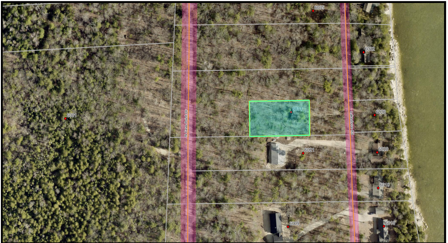
Map 2025 Orthophoto as default backdrop

... from the GIS Map of ... (//gis.co.door.wi.us/gismap) Door County, Wisconsin ... for all seasons!